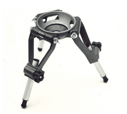
Visual Impact Northern Ltd | The Chapel | 192 Manchester Rd | Northwich | Cheshire | CW9 7NN